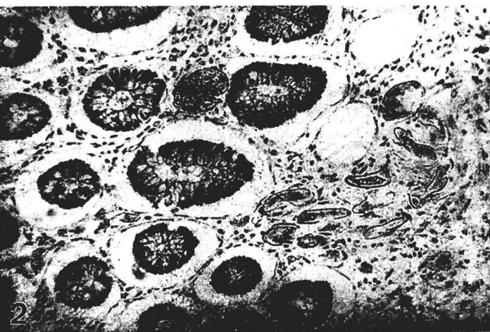
Fig. 2. Apical localization of PNA in the normal glands of schistosomal mucosa with heavy deposition of ova. ABC method. x 330

By Student's t-test between CCS and CC, ***: 0.001 < p < 0.01 ; **: 0.01 < p < 0.05 ; *: p = 0.05 . CCS: colorectal carcinoma with schistosomiasis; CC: colorectal carcinoma without schistosomiasis; MC: carcinoma containing 20% or more mucinous element; NMC: carcinoma containing no more than 20% of mucinous elements; P.Sulphom.: predominance of sulphomucins; P.Sialom.: predominance of sialomucins.